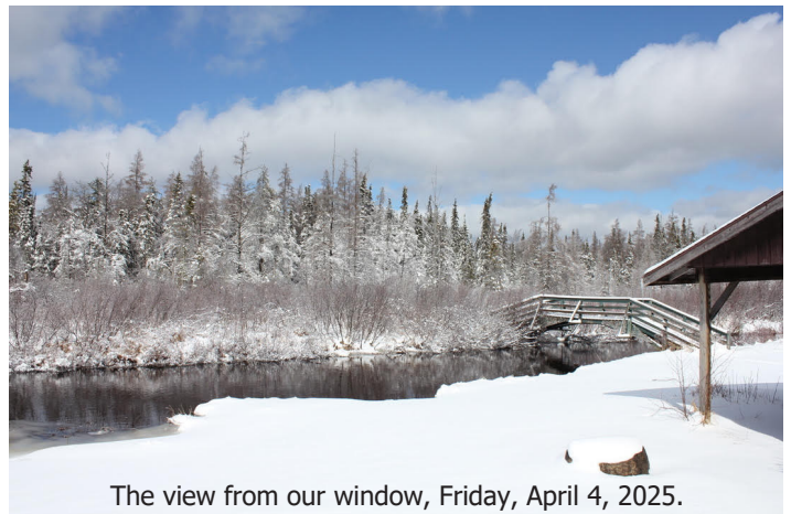
The view from our window, Friday, April 4, 2025.