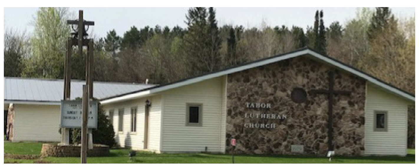
Wednesday Service 4 p.m. during Lenten Season Sunday Service 8:30 a.m.

Communion is celebrated every Sunday of each month; plus Holy Days