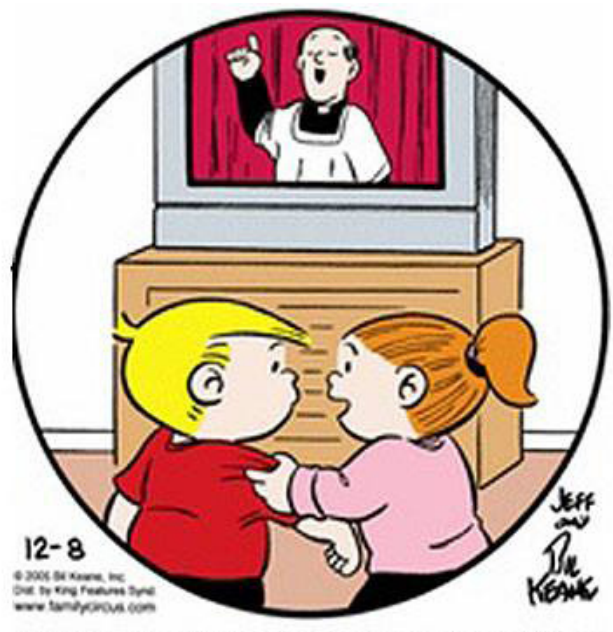
"Hear that? People in heaven have ever-laughing life."

God loved us at first sight, from eternity. And He has given us Jesus so that we can know His love. (Genesis 29:20)