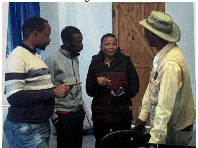
The translation team enjoying the keyboard app